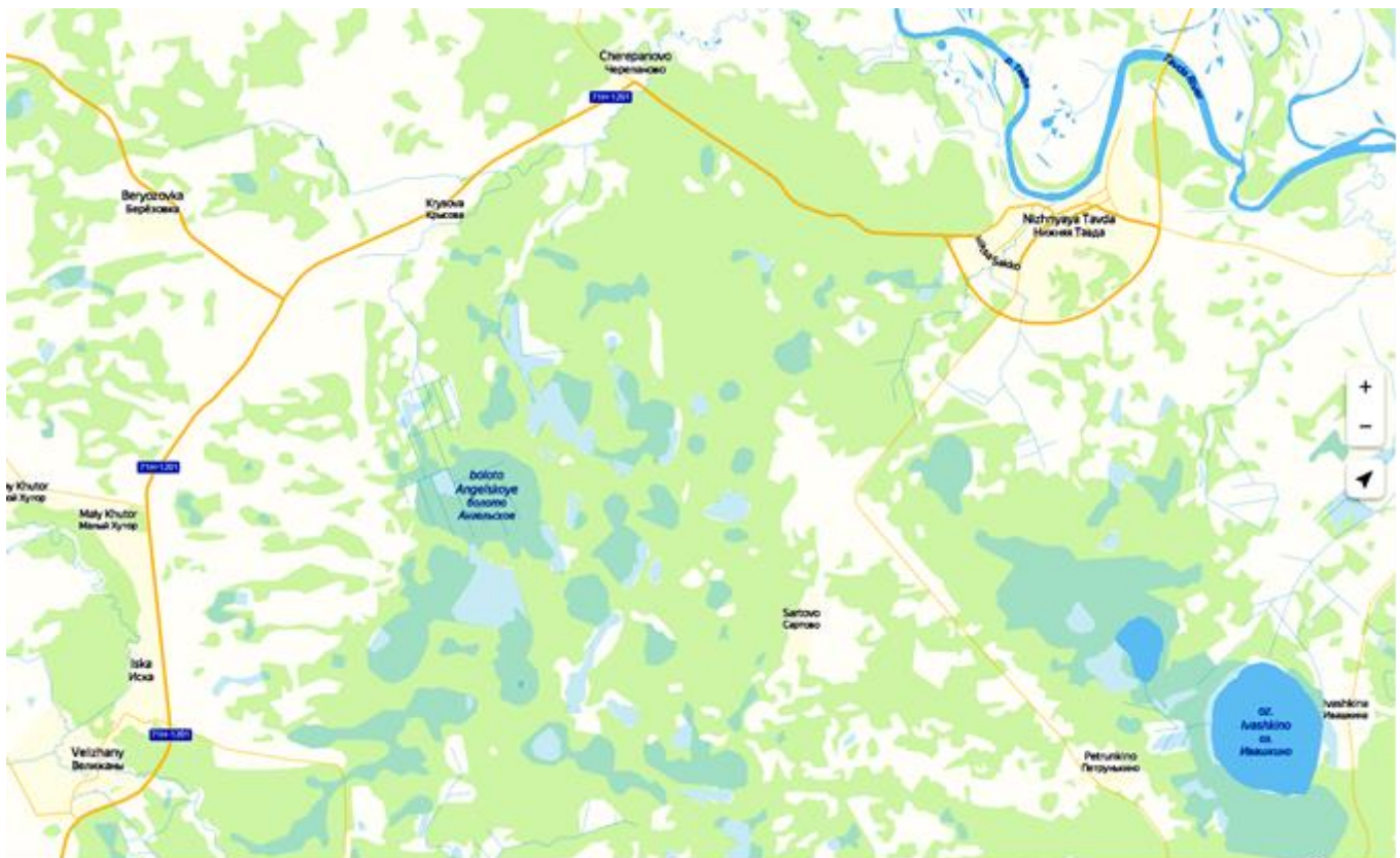
Figure 1. Research area. ( http://www.yandex.com/maps/?ll=66.010694%2C57.625015&z=11.8 ).

Studies to study the daily rhythm of trophic activity of blood-sucking mosquitoes were conducted in the sub-zone of the southern taiga forest zone of the Tyumen region (Russia) in 2017. For this purpose, two points were selected, combining several biotopes: the edge of the aspen-birch forest with a small admixture of pine and an adjacent open area of the meadow. On June 27-28, the accounting was carried out on the pasture of young cattle "Solontsy" Progress LLC, located southeast of the village of Iska, and on July 27-28 - on the pasture of PC "Moloko" near the village of Petrun'kino Nizhnetavdinsky district (fig. 1). On these pastures young cattle were kept around the clock: in the afternoon grazed in the meadow or in the forest, and on night rest was located in open paddocks.